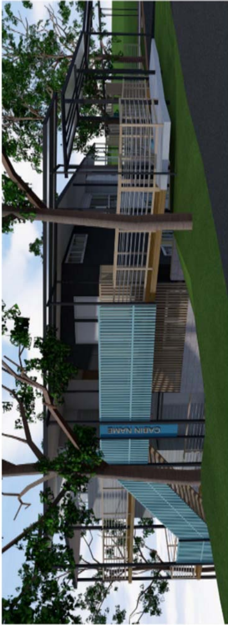
VIEW FROM ACCESS ROAD ENTRY