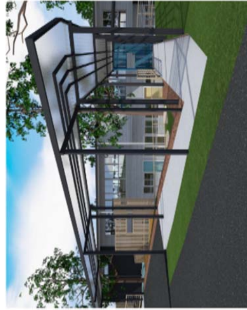
VIEW OF WALKWAYS AND PLAYSPACE FROM ACCESS ROAD