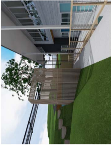
VIEW OF PLAYSPACE & KIDS FORT