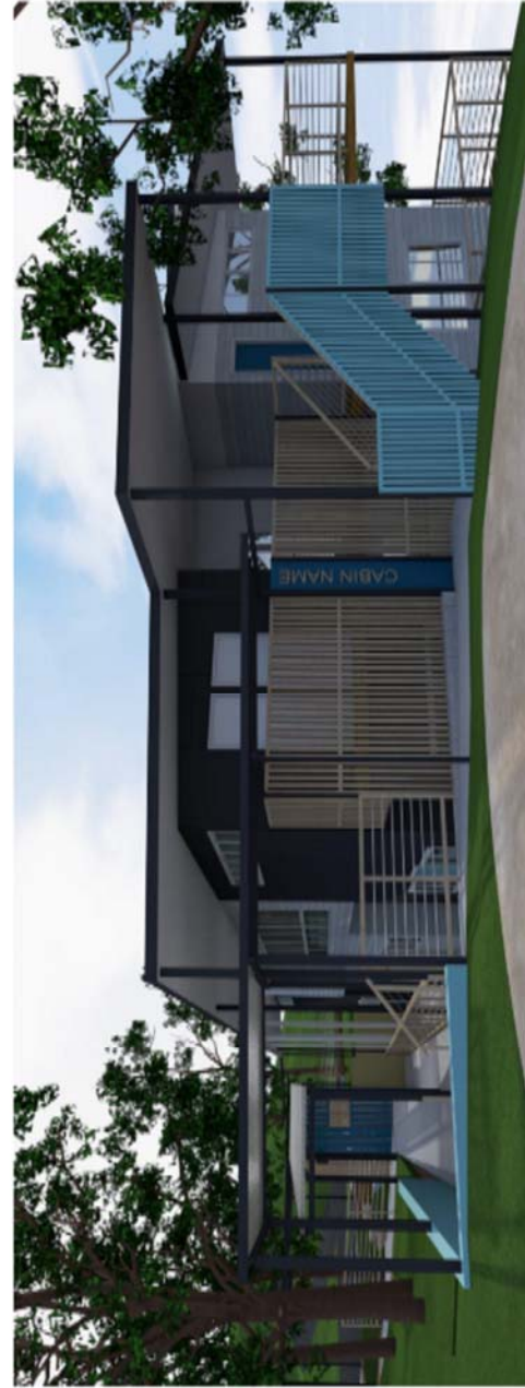
VIEW FROM FIREPIT AND GREEN SPACE